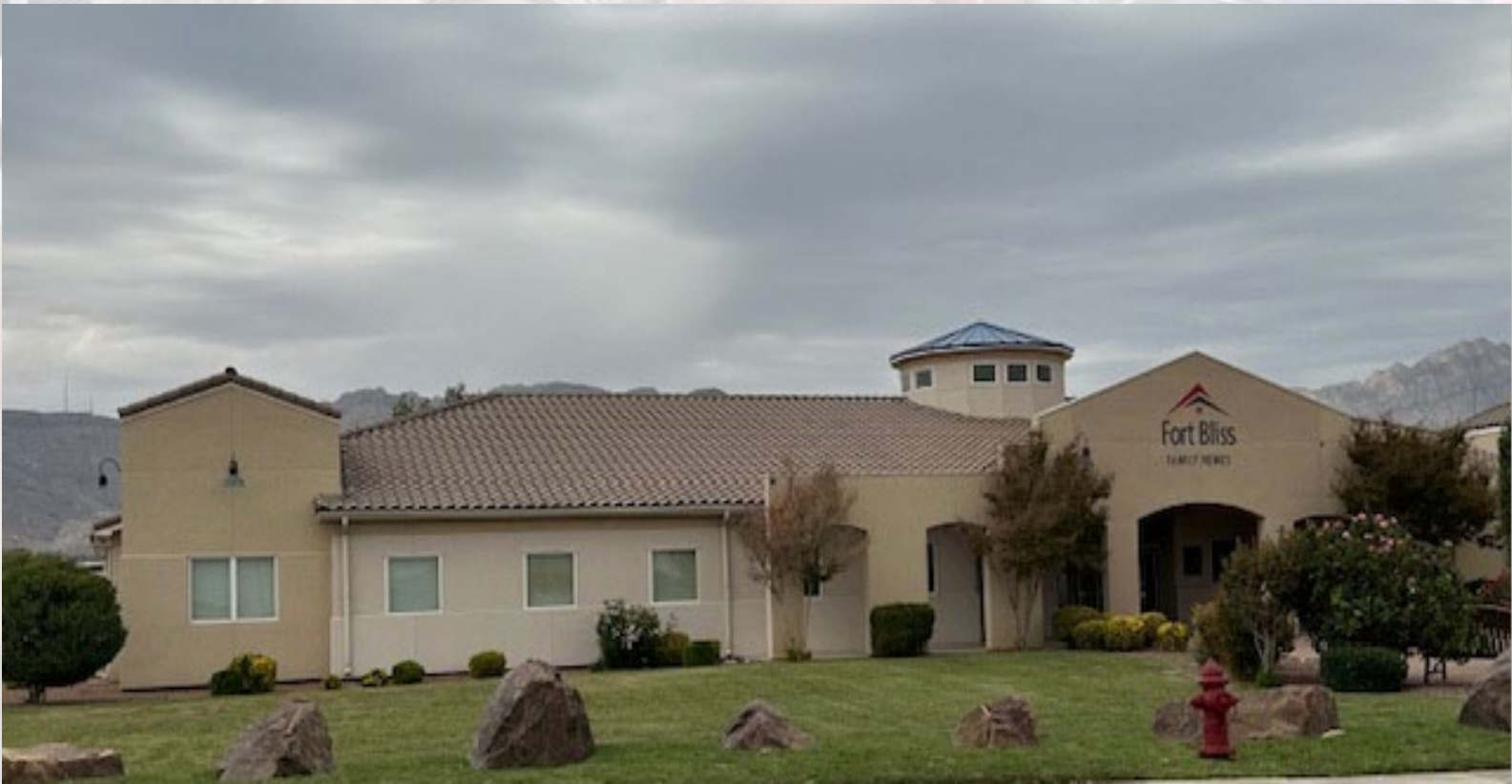
1991 Marshall Road